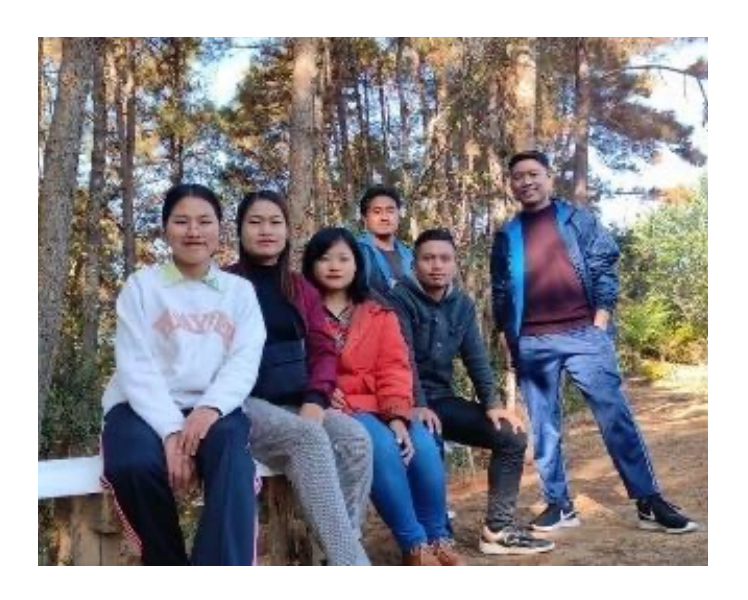
HOPE FOUNDATION ACADEMY, LANGMEI, TAMENGLONG DISTRICT, MANIPUR

NEST Fellowship. The North East Sunbird Trust Fellowship is an attempt at build social changemakers and leaders from the community. The Fellowship was started by Sunbird Trust in 2020. In the year 2021-22, the NEST fellows worked on community projects, held community meetings and awareness campaigns, learnt and executed Social Work Methods, attended online capacity building sessions and courses.