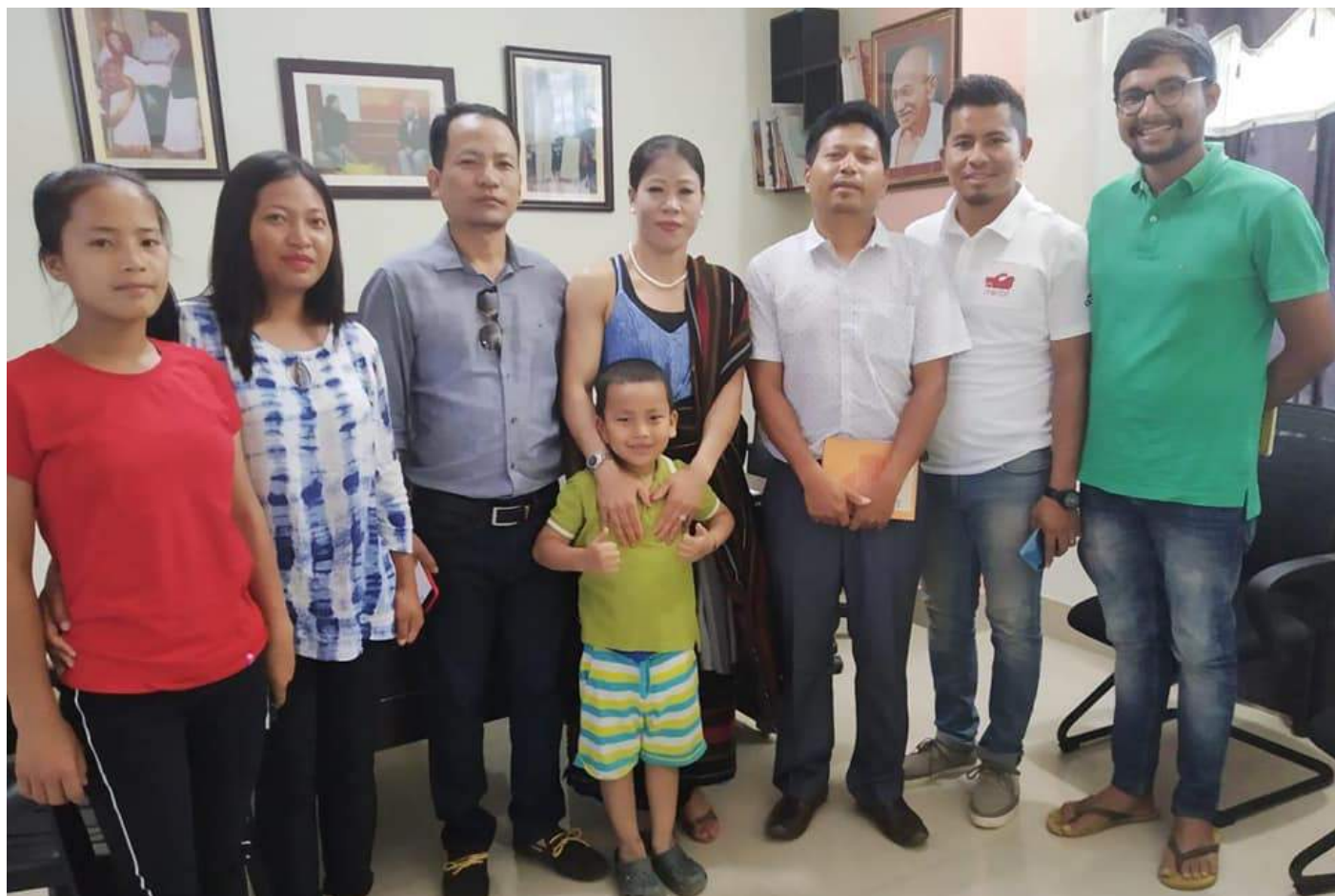
Meetings with Hon'ble Governor of Manipur, Dr. Najma Heptullah (25th February 2020) and boxing legend Mary Kom (22nd June 2019)