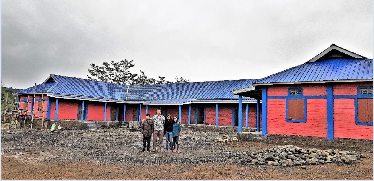
Lyzon Friendship School, Khomunnom Village, Manipur, inaugurated 27 Sep 18