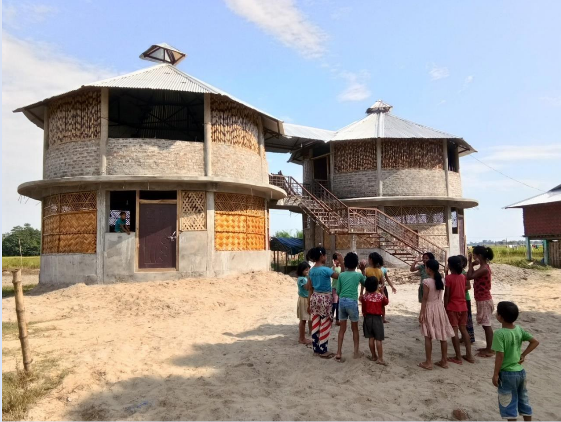
Classrooms at Majuli Island part sponsored by Sunbird Trust