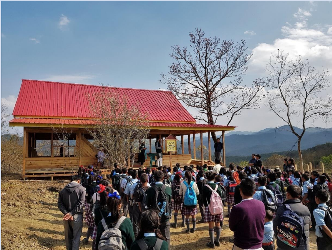
Learning House at Lyzon Friendship School, Khomunnom, Manipur