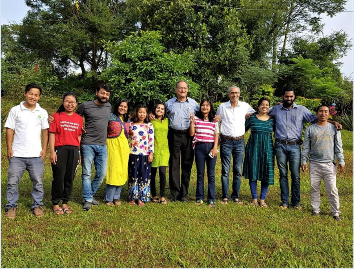
The Force behind it all – Team Sunbird Trust, 22 young professionals from across India