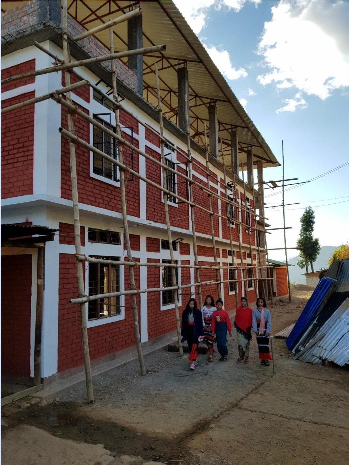
Jai Shivshakti – Sunbird Trust Friendship Hostel, Ijeirong, inaugurated 21 st Feb 2019 at Ijeirong Village, Manipur