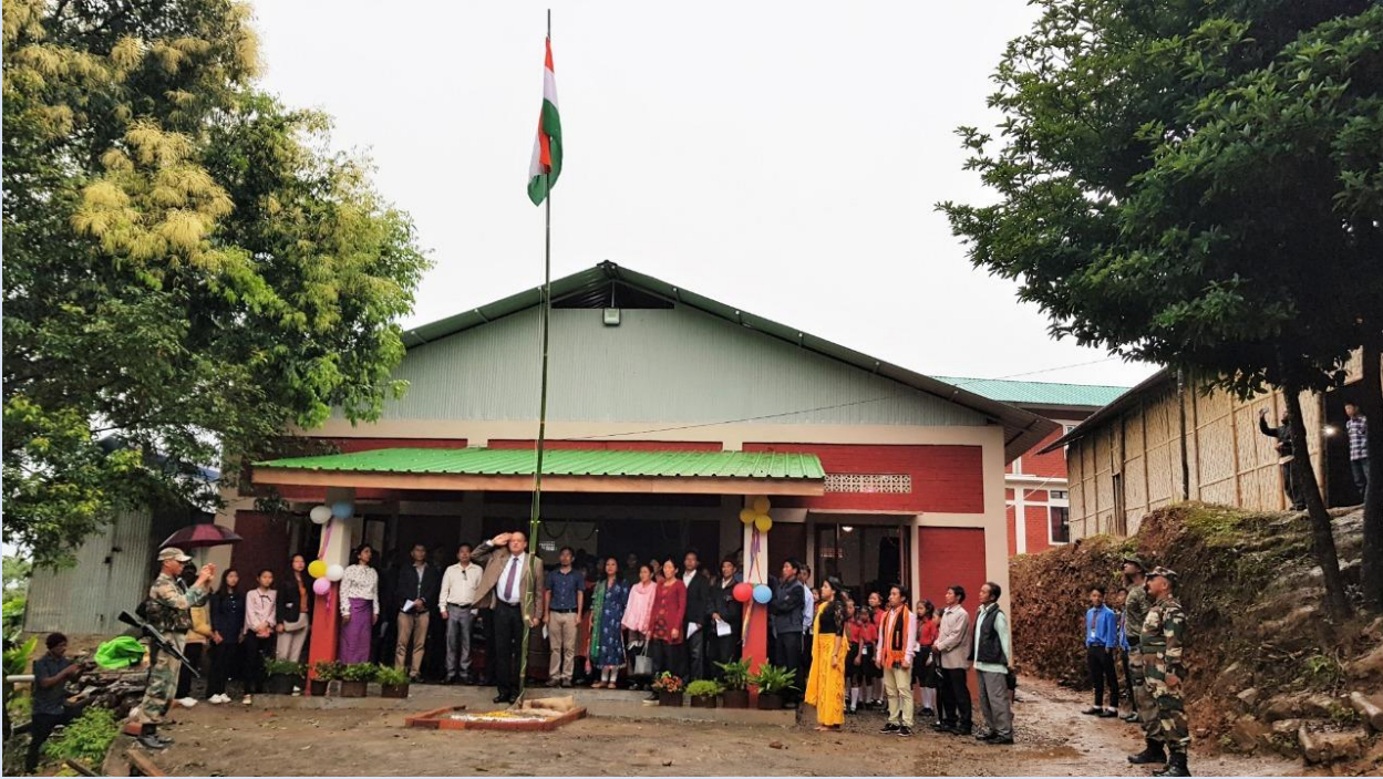
Inauguration of Sunbird Trust– HDFC Dining Hall at Ijeirong Village, Manipur on 15 Aug 2019