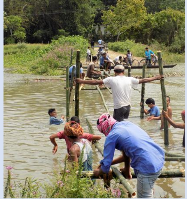
Pedestrian bridge being built at Majuli Island, Assam under Goonj “Cloth for Work” programme

Completely satisfied with the partnership, Goonj brought tons of aid to Ijeirong and jungle track was turned into a metaled one-kilometer road. More than 250 village people from 5 neighbouring villages joined the endeavour. The splendid product now makes it easier for children to reach their school and for farmers to access their fields and bring back the produce. The Road is now called the Goonj-Sunbird Trust Lampui.