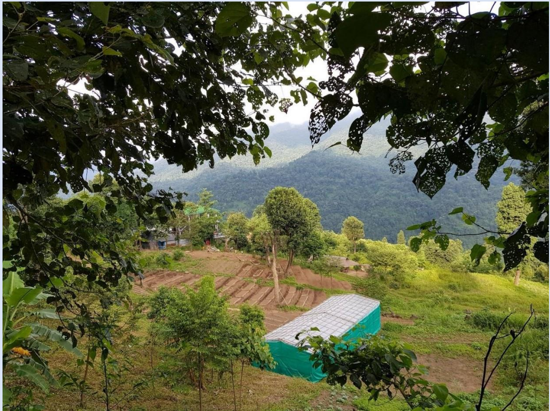
Ravishankar-Sunbird Trust Farm, Ijeirong