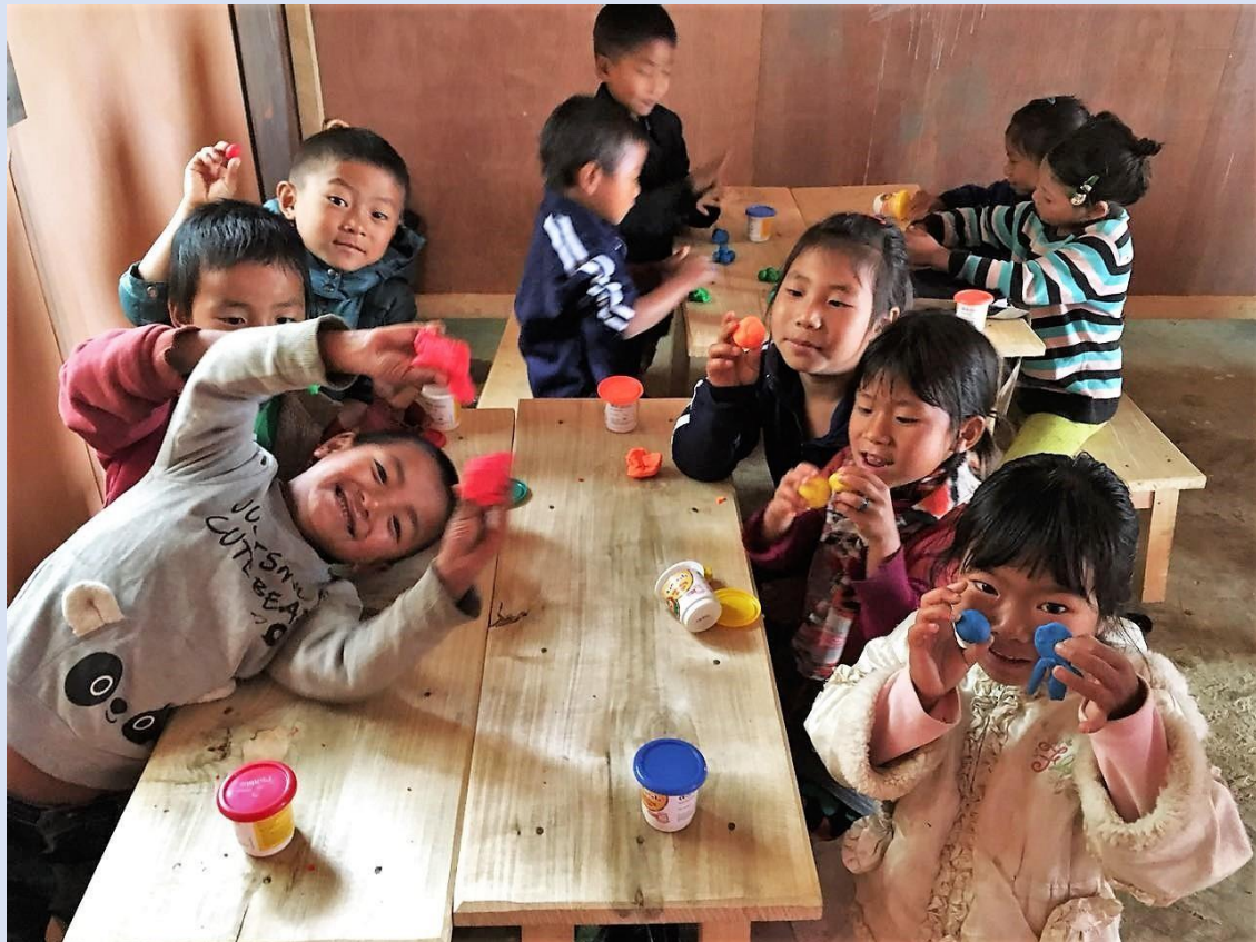
Sungcham Friendship School, Inaugurated Apr 2019