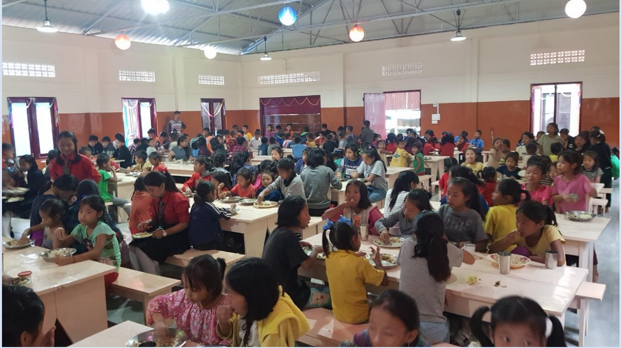
Inauguration of Sunbird Trust– HDFC Dining Hall at Ijeirong Village, Manipur on 15 Aug 2019