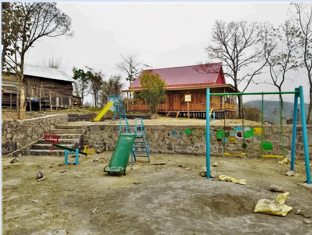
Children Play area at Lyzon Friendship School, Khomunnom, Manipur