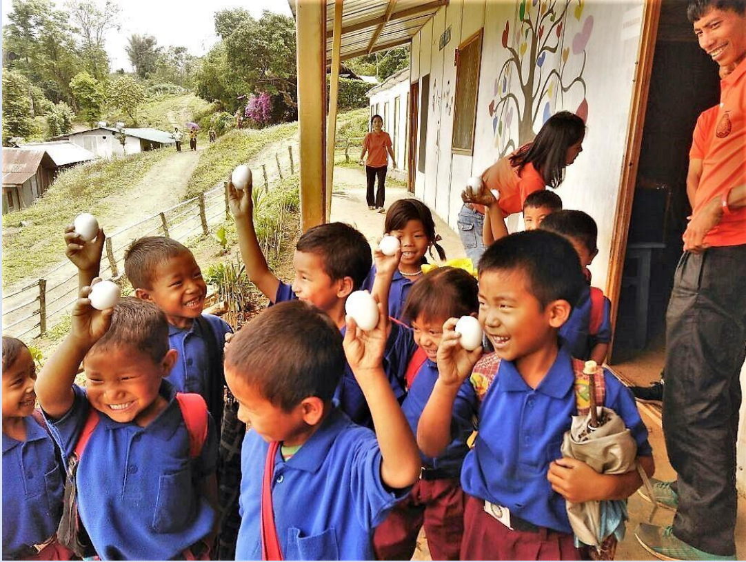
Nutrition Scheme (Egg a Day)