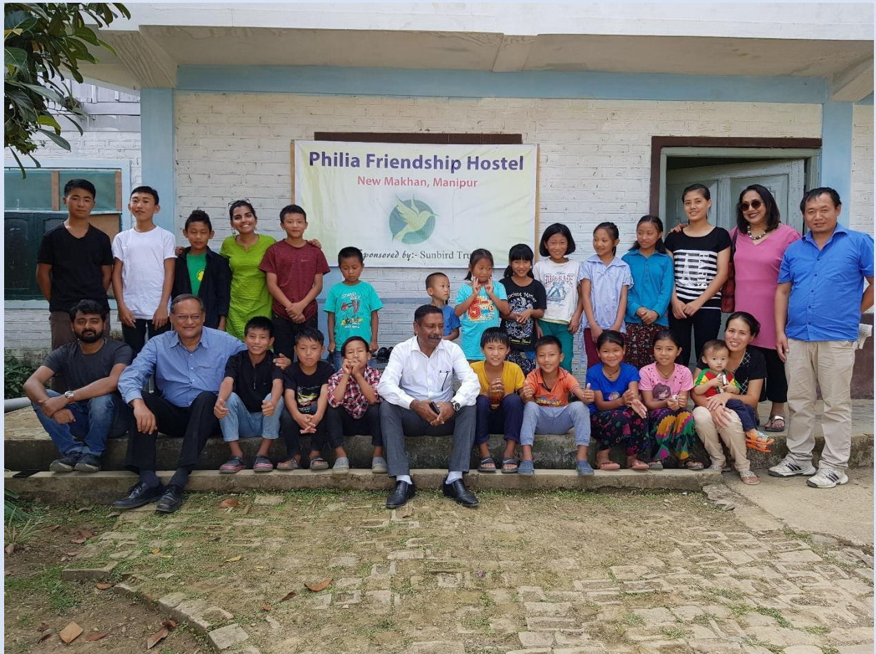
Above: Philia Friendship Hostel inaugurated February 2018. It has 30 underprivileged students. It is in free accommodation provided by the local college. Below: Aspect-Sunbird Friendship Hostel at Tamei inaugurated Feb 2019