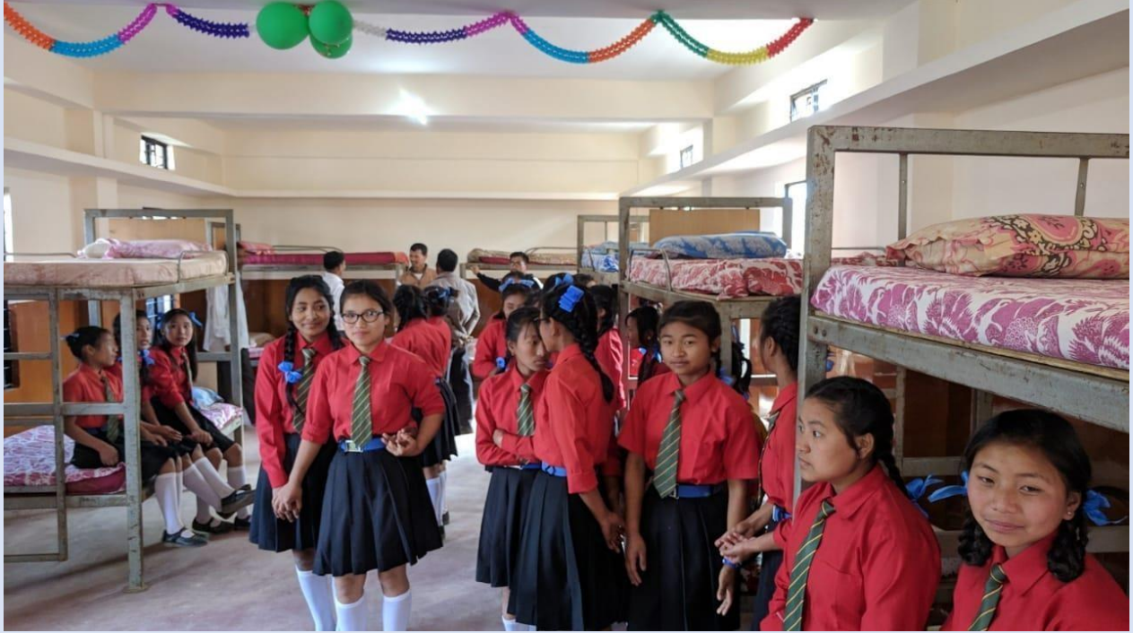
Jai Shivshakti – Sunbird Trust Friendship Hostel with toilet and bath block (Below)