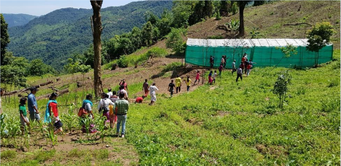
Above: Ravishankar-Sunbird Trust Farm, Ijeirong Below: Organic Farming training