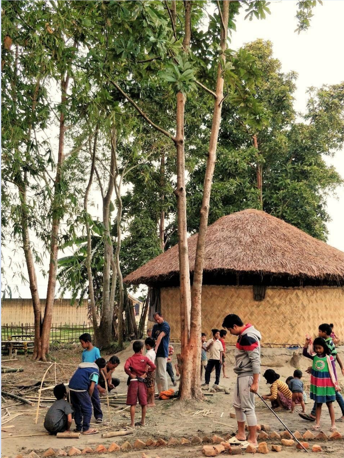
Classroom at Majuli Island, part sponsored by Sunbird Trust