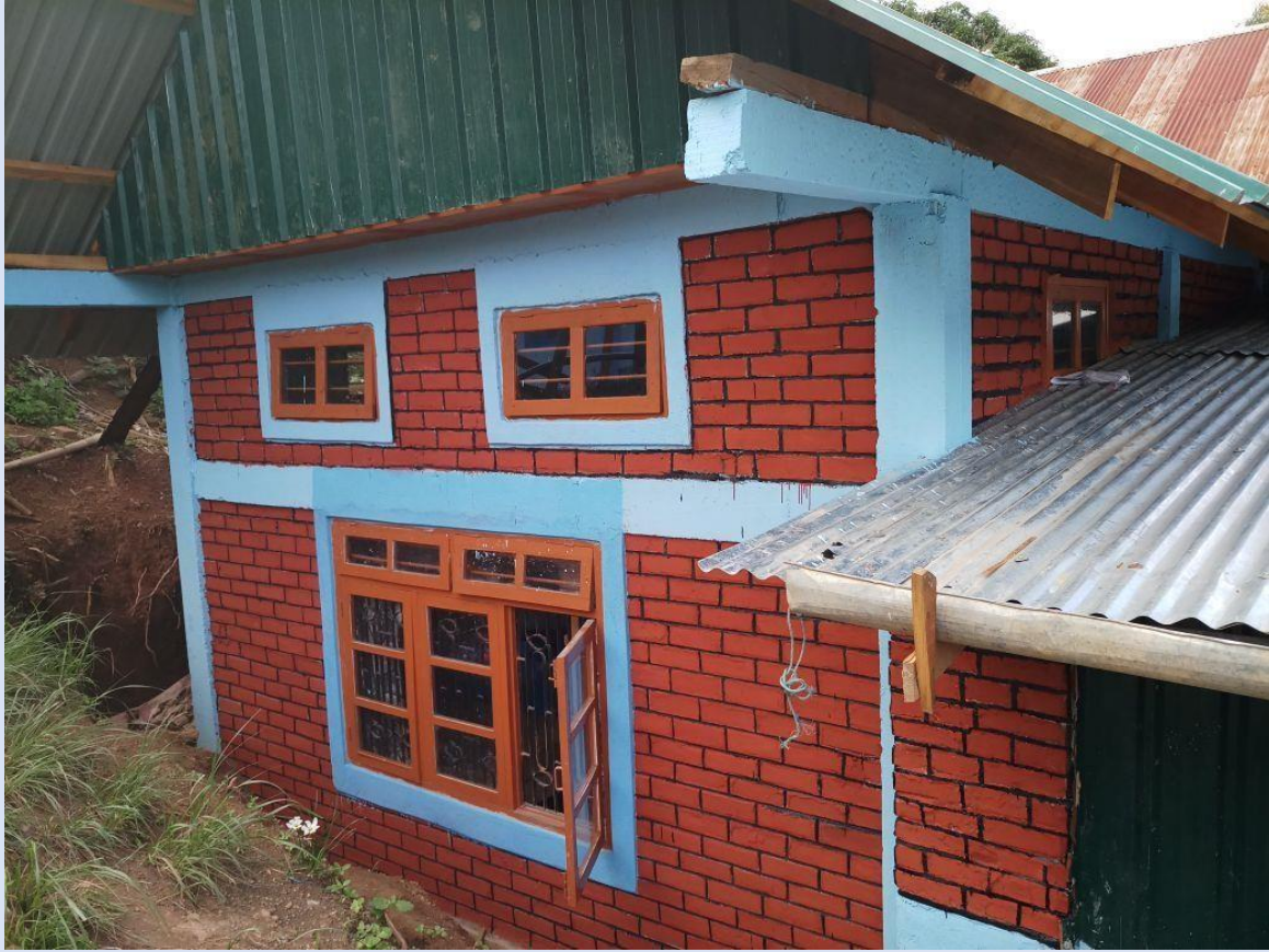
Sunbird Friendship Hostel, Sajik Tampak.