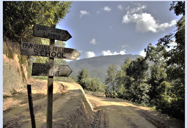
250 persons from 4 villages in the process of making the Goonj-Sunbird Trust Lampui Road at Ijeirong Village under Goonj “Cloth for Work” Programme.