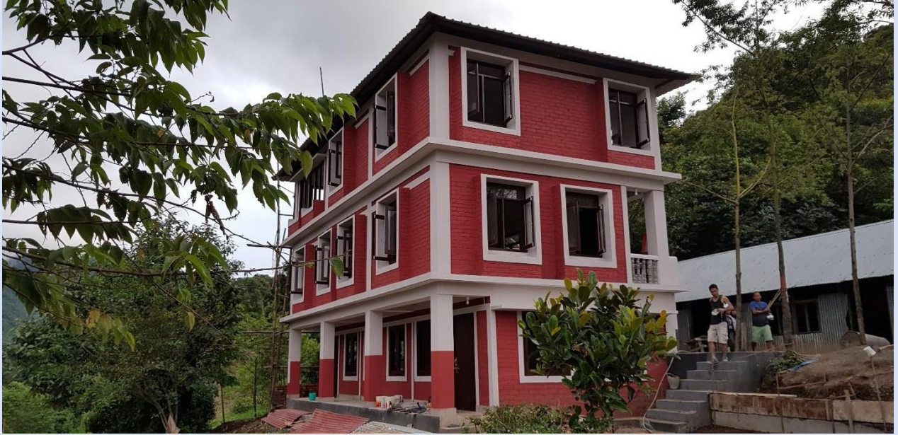
18 Terminal Anaha – Sunbird Computer Skilling Centre, inaugurated 15 Aug 2018